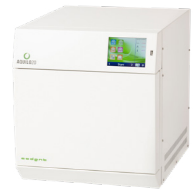
AQUILO 20 WHITE