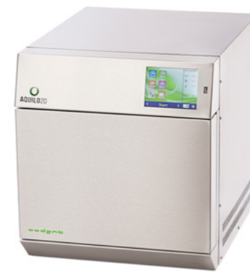
AQUILO 20 STAINLESS STEEL

Equipped with an easy-to-use electric closing door allows to offer totally smooth surfaces, free from any ribs that could generate a bacterial nest. It becomes easy to clean for more hygiene and durability.